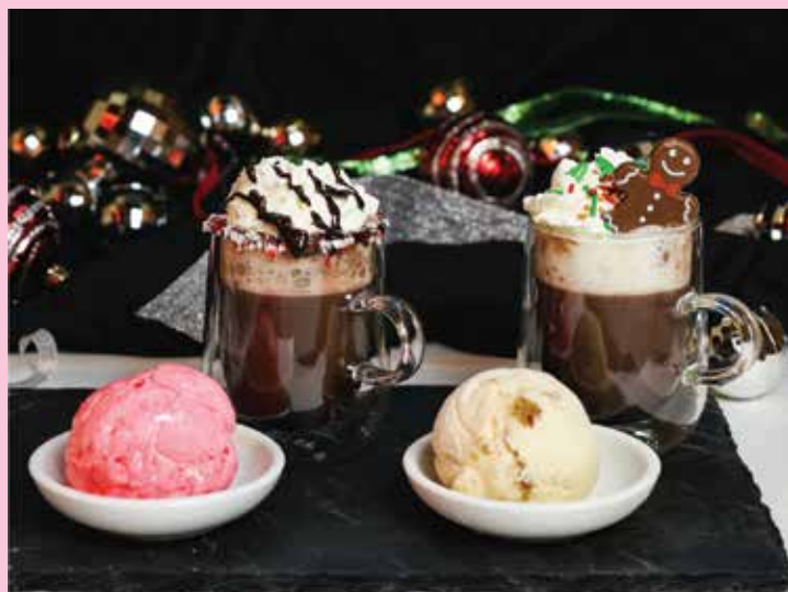
tipsy hot chocolate duets

TIPSY DUET + PAIRINGS 19 any two tipsy hot chocolates, add pairings