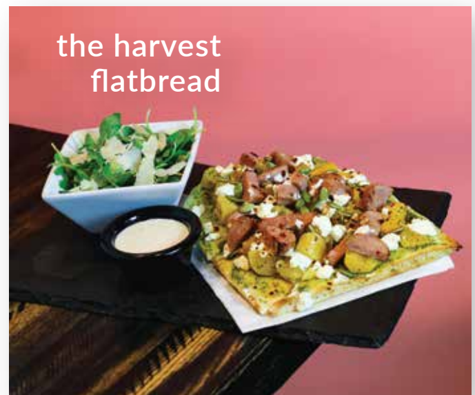
the harvest flatbread

FIG PROSCIUTTO 14 fig jam, prosciutto, four-cheese blend, arugula, and balsamic reduction