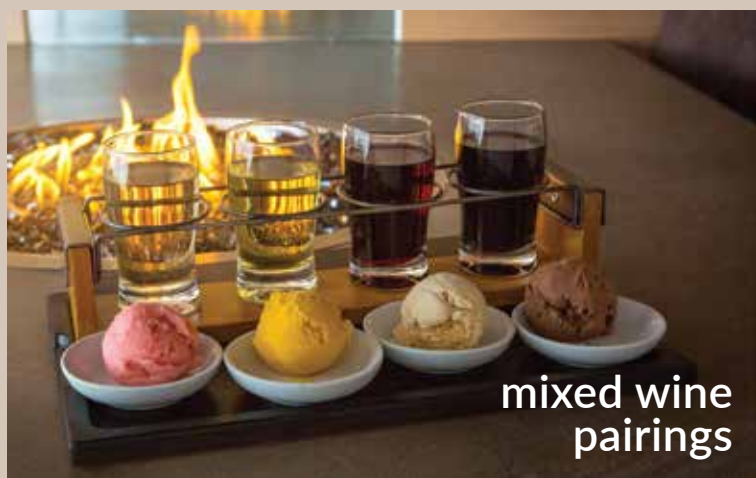
mixed wine pairings

We've specially paired our ice creams with four wines or beers to create an playful tasting experience!