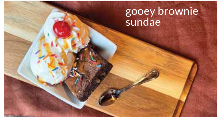
gooey brownie sundae