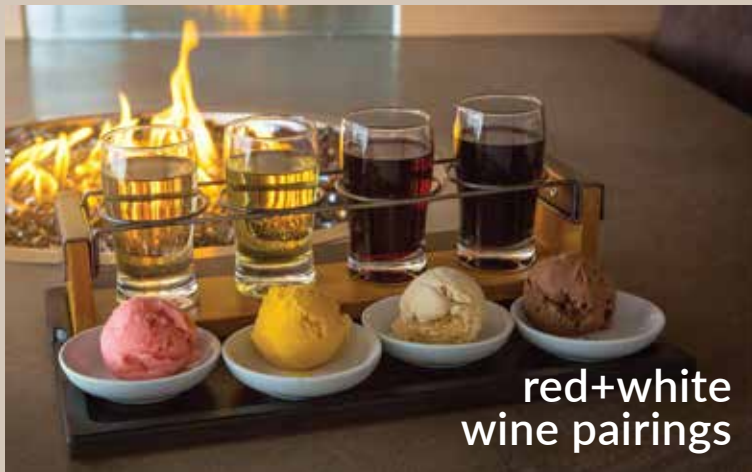
red+white wine pairings

We've specially paired our ice creams with four wines or beers to create an playful tasting experience!